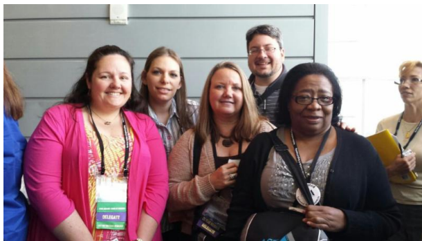
Missouri delegates waiting to vote.